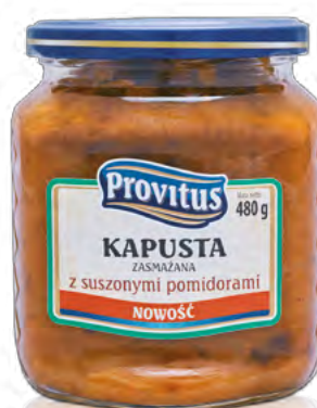
Fried Cabbage with Sun Dried Tomatoes

Capacity: 520 ml Packet: 6 pcs Pallet: 864 pcs