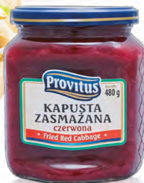
Fried red cabbage

Capacity: 520 ml Packet: 6 pcs Pallet: 864 pcs