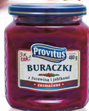
Beetroots with Apples & Cranberries

Capacity: 520 ml Packet: 6 pcs Pallet: 864 pcs