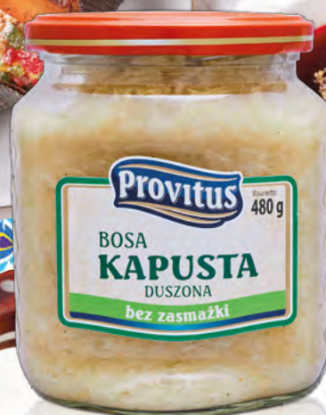
"BOSA" stewed cabbage

Capacity: 520 ml Packet: 6 pcs Pallet: 864 pcs