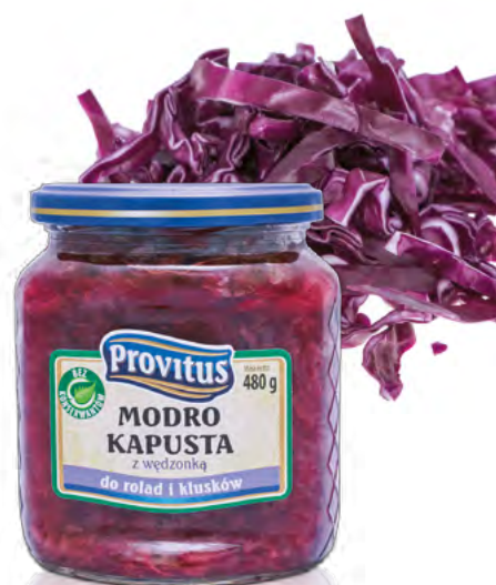
MODRO Cabbage silesian style

Capacity: 520 ml Packet: 6 pcs Pallet: 864 pcs