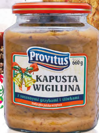
"Christmas" Cabbage with dried mushrooms and plums

Capacity: 520 ml Packet: 6 pcs Pallet: 864 pcs