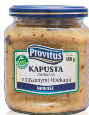
Fried Cabbage with Dried Plums

Capacity: 520 ml Packet: 6 pcs Pallet: 864 pcs