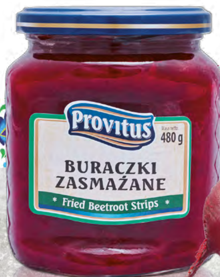
Fried beetroots strips

Capacity: 520 ml Packet: 6 pcs Pallet: 864 pcs