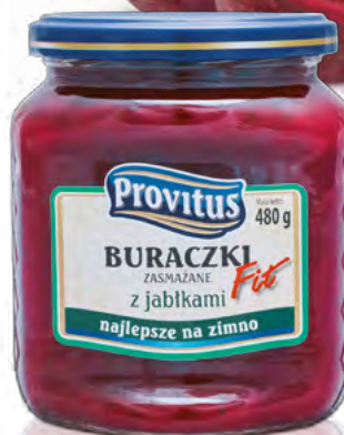
Fried Beetroots with Apples FIT

Capacity: 720 ml Packet: 6 pcs Pallet: 672 pcs