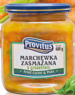
Fried carrot & peas

Capacity: 520 ml Packet: 6 pcs Pallet: 864 pcs